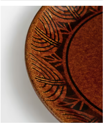
Available in 0 shapes